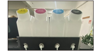
Stable bulk system